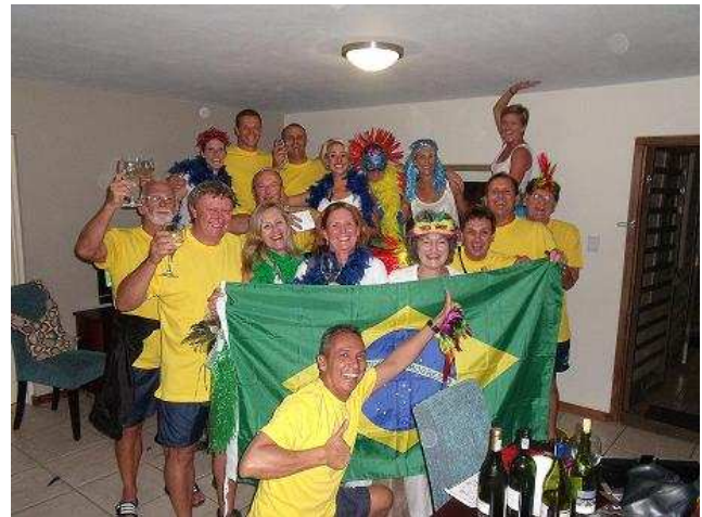
CTM in party mood – what's new?