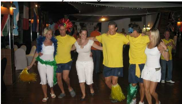
The youngsters get down and boogie

Here are some photos of the event – you'll notice there weren't many swimming shots taken!