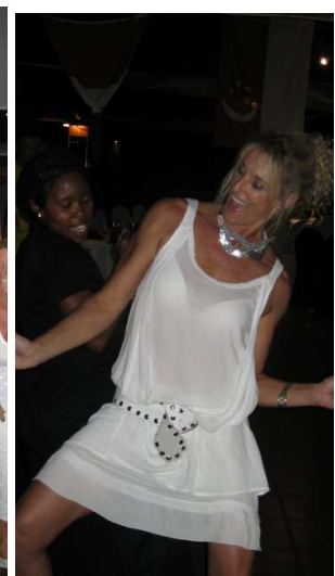
Two of our scariest party animals