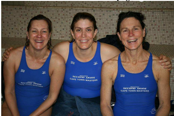
The girls costumes were sponsored by Second Skins