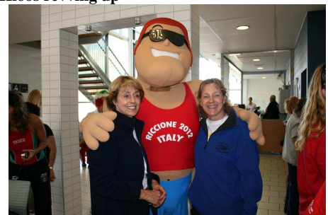
Anybody for Riccione in 2012?