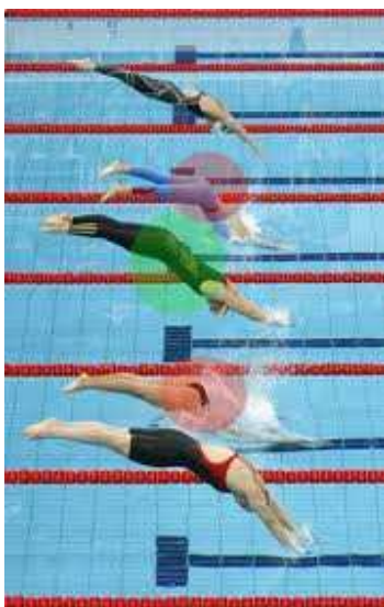
Note the two circled (incorrect) starts

A good rule of thumb for elite swimmers is that they should not kick until their velocity is below their average swimming velocity.