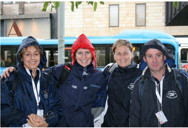
The weather wasn't always great