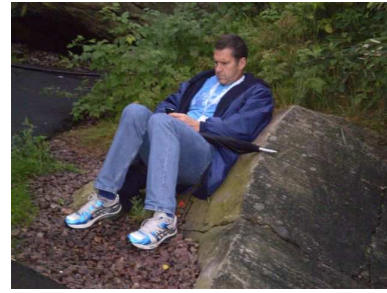
(I just know I'll be in trouble if I comment on this one...)